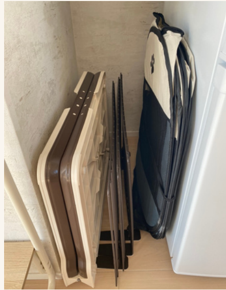
Pet playpen, etc.