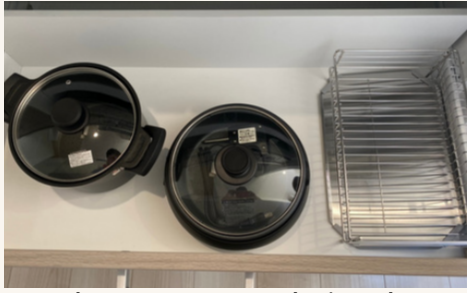
Cooking utensils/Dish rack